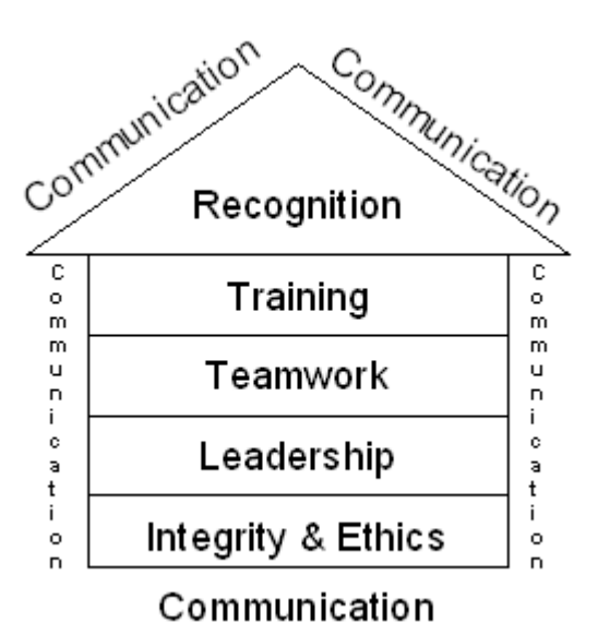
IV. Roof – It includes: Recognition.

III. Binding Mortar – It includes: Communication.